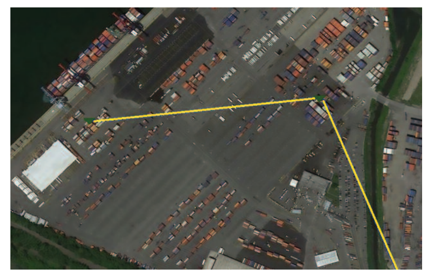
PINPOINTING the position