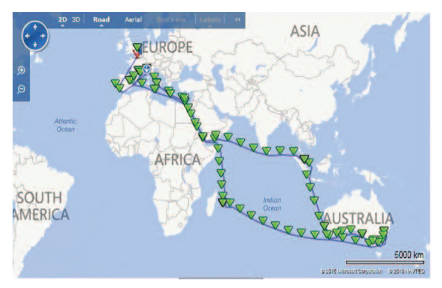
FOLLOW the container from departure to destination